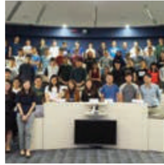
Maritime Touch Programme, 8 February 2017

To support the job search efforts of this year's graduates, the Maritime Singapore Connect (MSC) Office was involved in various university career fairs during the first quarter of the year. Students appreciated the resume deposit function and other helpful tools in the new MSC website, when looking out for jobs and internship opportunities within the industry.