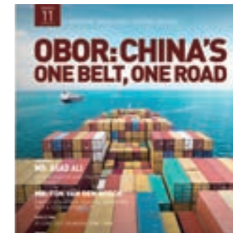
Maritime Knowledge Shipping Session 35, 29 June 2017

SMF ran a month-long advertisement campaign with Golden Village (GV) cinemas to coincide with the screening of blockbuster movies Transformers: The Last Knight, and Spider-Man: Homecoming. A new maritime profiling video featuring careers that are critical for the maritime manpower pipeline was screened as a commercial at theatres island-wide. Such outreach efforts aim to inform youths about the potential of the maritime industry.