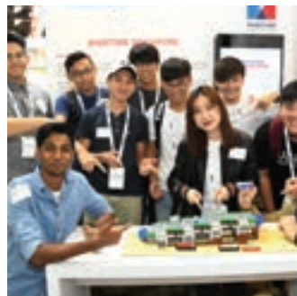
Sea Asia Youth Tour and Youth Lego Competition (Panama Canal Edition), 27 April 2017

The maritime industry has always been a vital part of Singapore's economy. As we are presented with future challenges, it is important for us to continue innovating and improving ourselves. To me, being part of a team in creating ships or ocean-going vessels gives me the motivation and satisfaction to keep my passion alive.