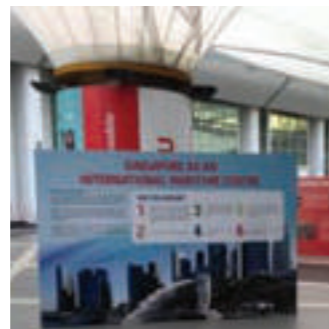
Polytechnic Maritime Exhibition, 22 – 26 May 2017

The Maritime Experiential Programme is organised specially for secondary school students and aims to raise awareness of maritime education and careers through interactive learning journeys. Three sessions including educational tours to Singapore's shipyards and port terminals were held earlier this year, and were well attended by over 150 staff and students from various IHLs.