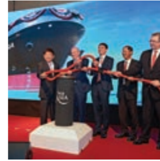
Sea Asia 2017, 25 – 27 April 2017

Through recent industry engagement activities, the MSC Office identified engineering as a discipline of interest to many maritime employers. This year's Maritime Spotlight Campus Series catered to such industry feedback, and reached out to engineering undergraduates at NTU and NUS. These lunch time talks featured speakers from Jurong Port, Keppel, PSA, Sembcorp Marine and the Society of Naval Architects and Marine Engineers, Singapore (SNAMES).