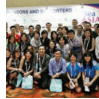
Sea Asia Tour for Career Counsellors, 27 April 2017

Co-organised by Seatrade and SMF, the three-day event was held at Marina Bay Sands and had close to 15,000 participants from 85 countries. The show also saw participation from 448 exhibitors and three new national pavilions. Conference attendees were treated to an exciting line-up of talks, from a Parliamentary Debate, to discussion on the Fourth Industrial Revolution. Sea Asia returns from 9-11 April 2019.