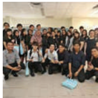
Maritime Experiential Programme, 22, 23 & 25 May 2017

On the final day of the Sea Asia Show, SMF held the Sea Asia Youth Tour which saw a gathering of over 221 attendees from the Institutes of Higher Learning (IHLs). In conjunction with this tour, a Youth Lego Competition (Panama Canal Edition) was held as a fun and interactive activity to promote the industry to students. The competition was supported by the Panama Canal Authority.